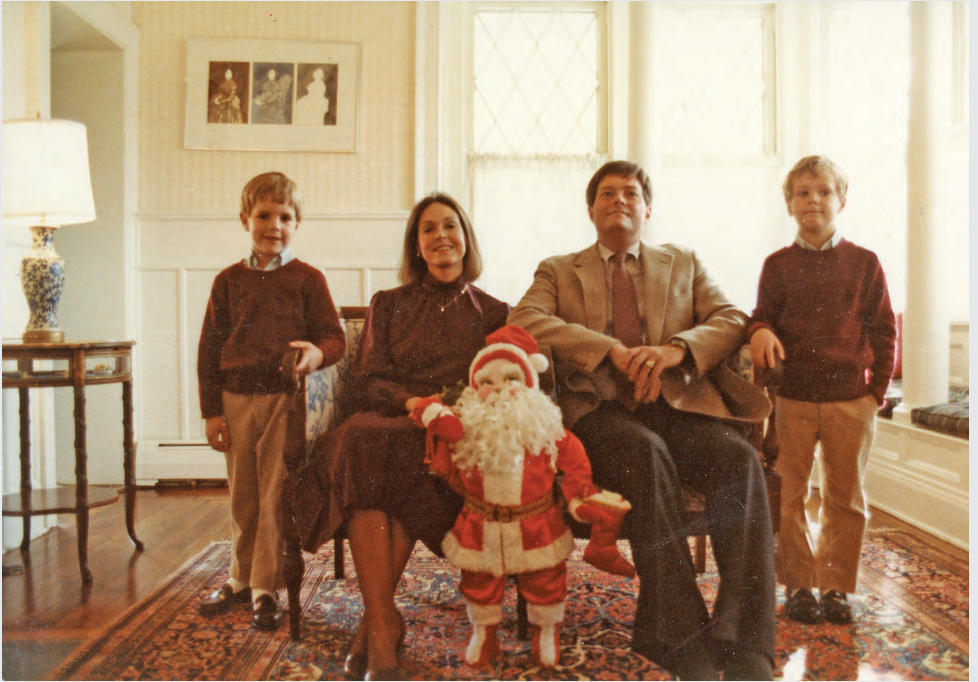
Seybold Gothic at 6 Lake Avenue.