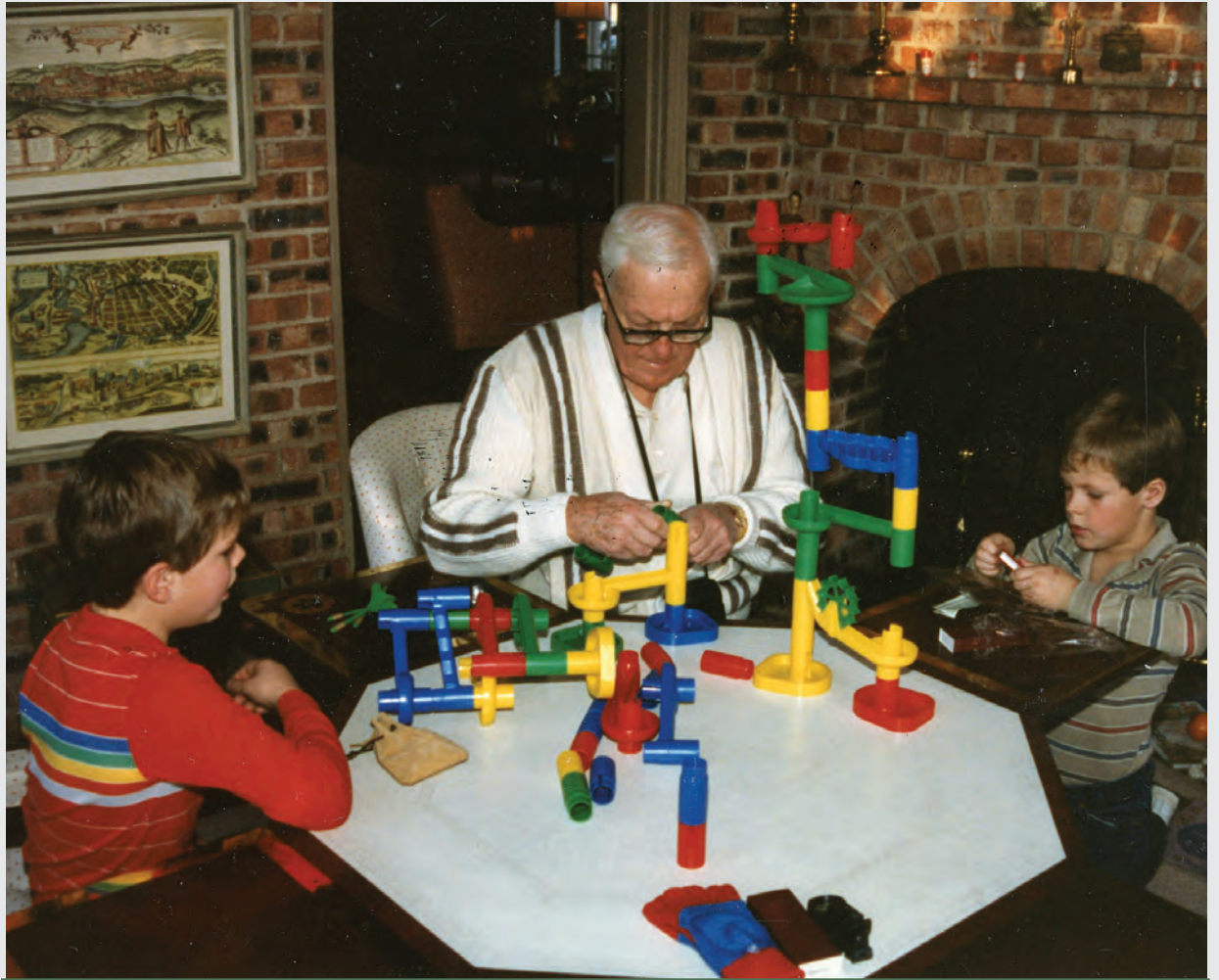
Above, Christmas 1986.