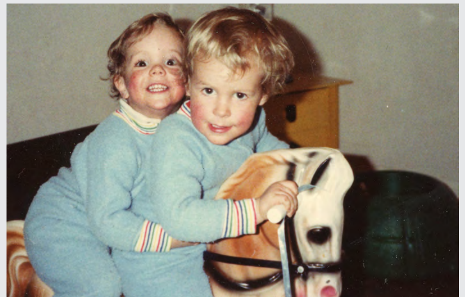
Above: Moe, Shemp and Larry? Above right: Happy trails. Below right: Cowboys.