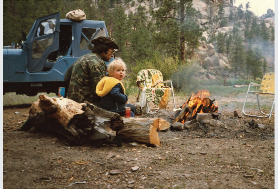
Clockwise from upper left: Don't look down! Metberry Gulch. Campfire tales.