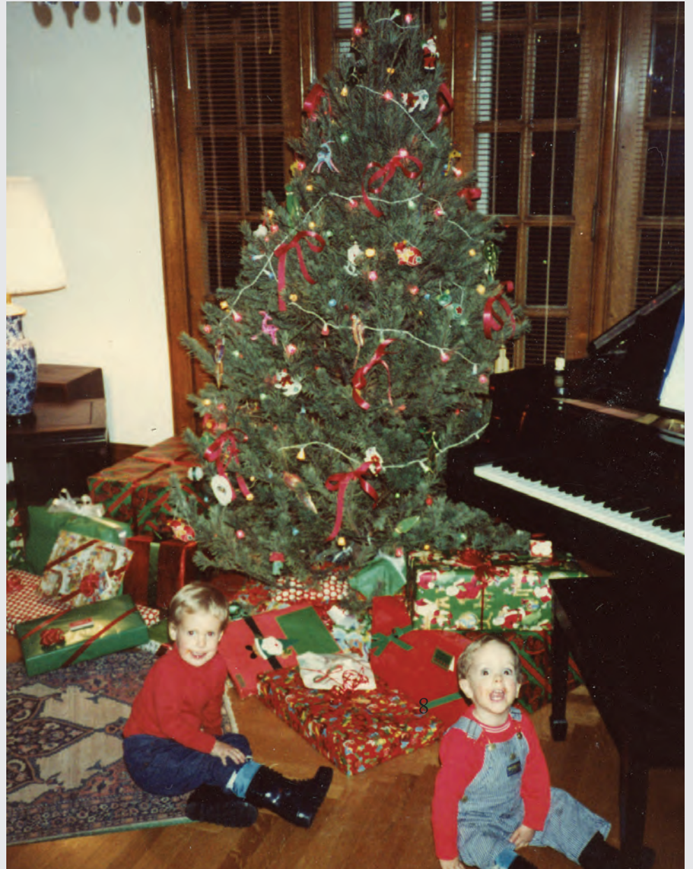
Christmas 1980, Cascade Ave.