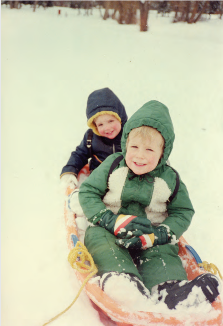
At the park.