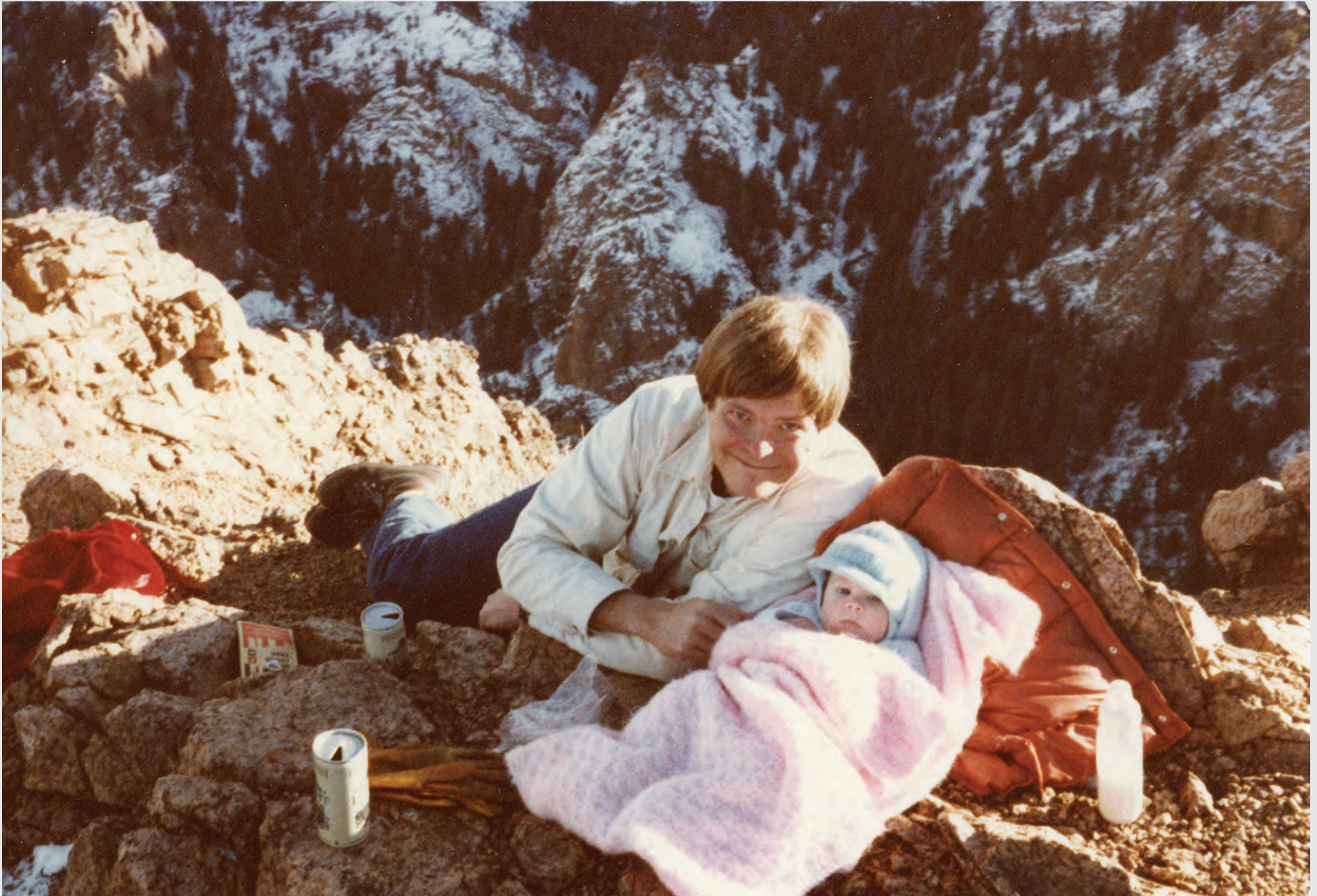
Fall 1977, Columbine Trail. The difference between men and baby boys . . . the beverages! Photo on book cover: Sept. 15, 1979.