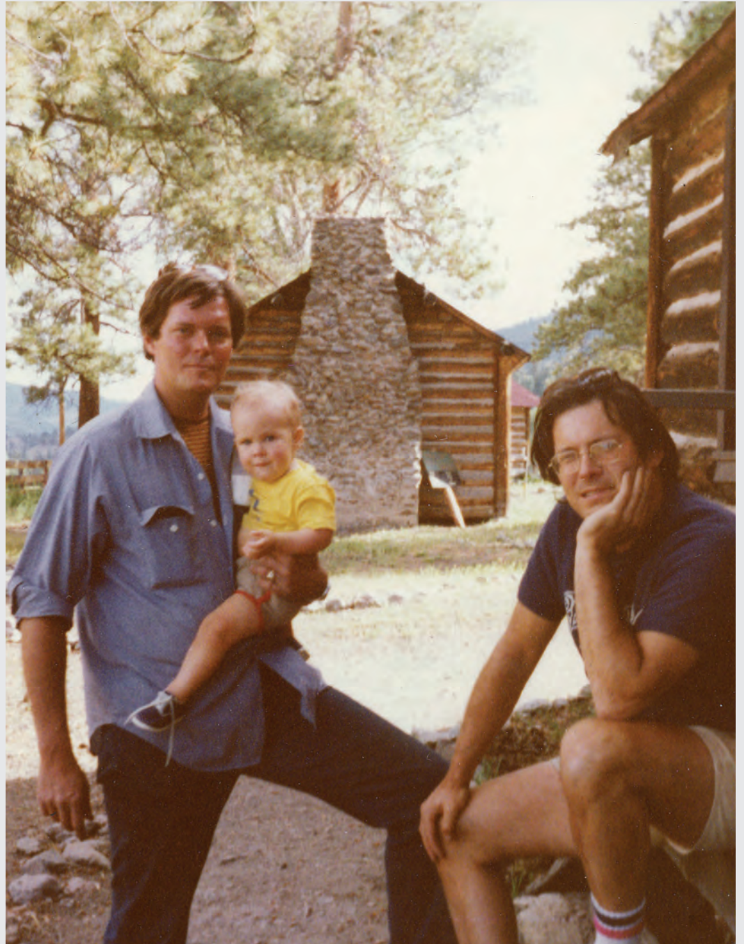
Both photos are from the summer of 1978. At right is Ute Trails Boys Camp.