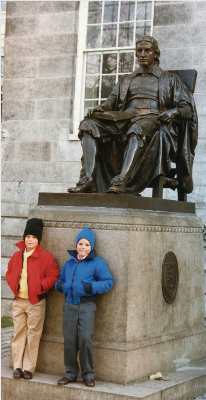
Above, Cambridge 1986.