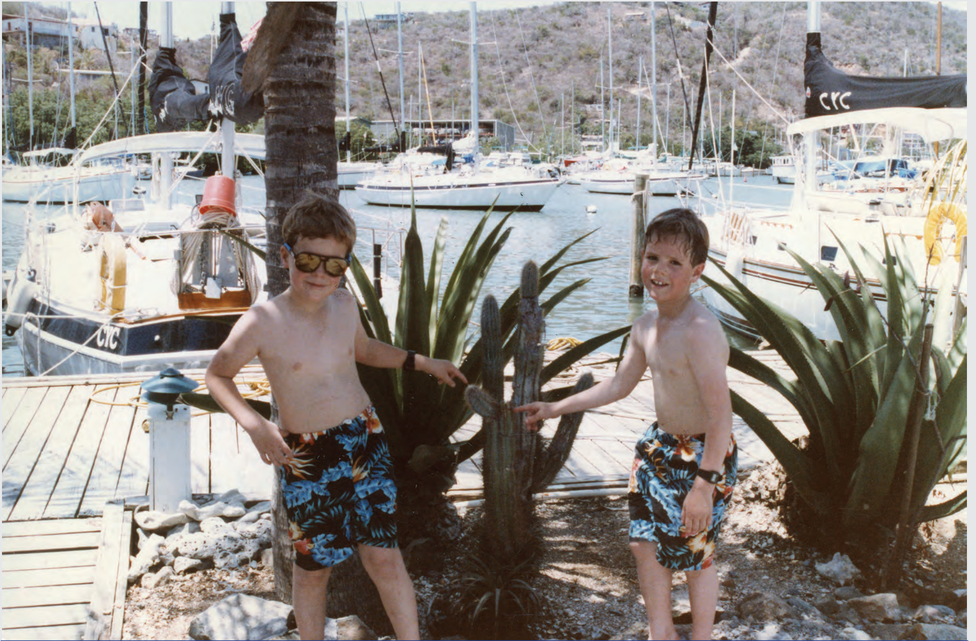
Ready to sail.