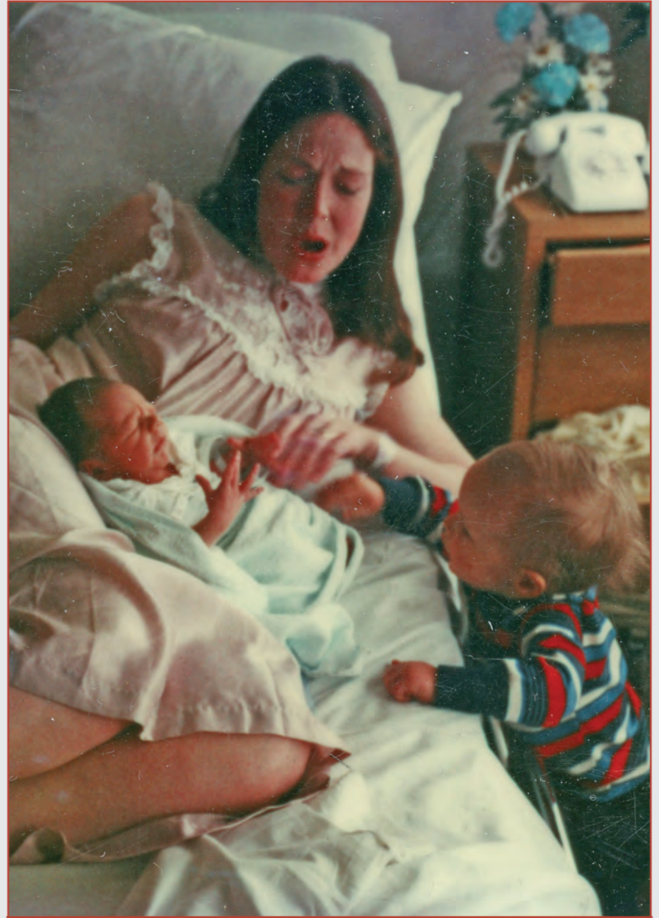
The battle begins!