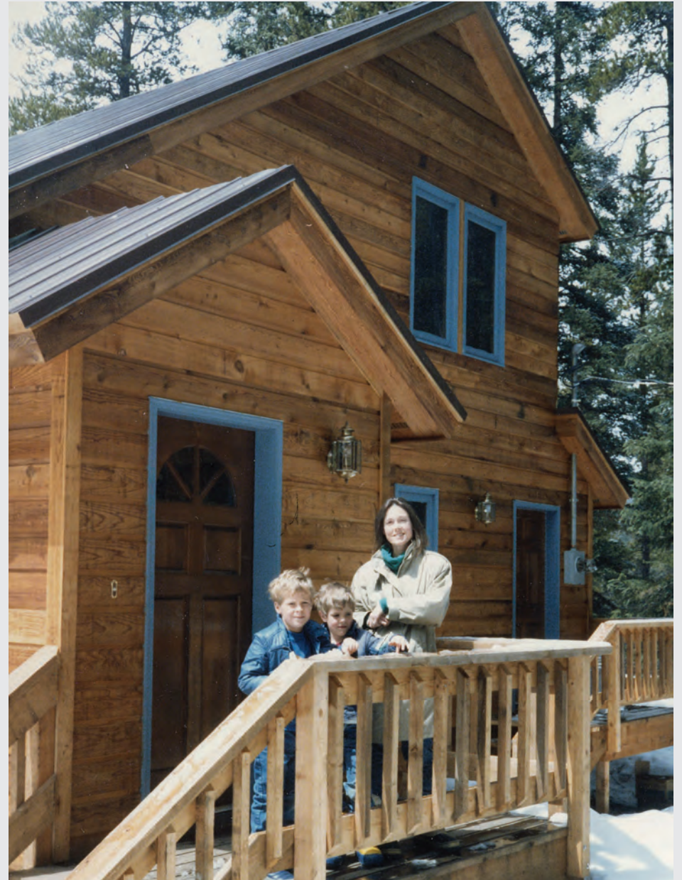
Counterclockwise from top left: Christmas 1984; Easter at Cheyenne Mountain Country Club; Blue River.