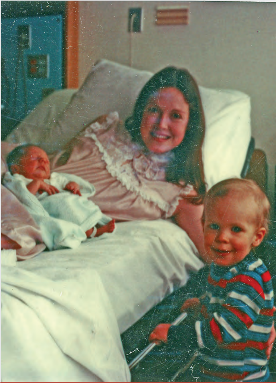
February 25, 1979.